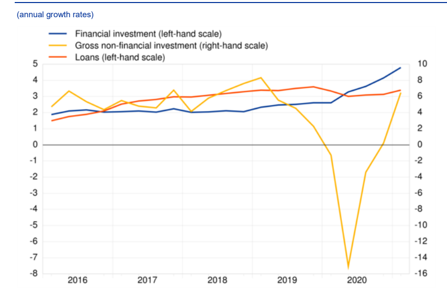
Chart 2. NFC gross-operating surplus, non-financial investment and financing